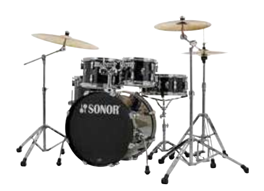
Studio Setup (additional items shown)

The AQ1 Series has been newly designed and engineered from ground up by the SONOR team in Bad Berleburg, Germany. Designed not only visual by a new lug and badge but also acoustical by the isolating "SmartMount" that allows for significant better resonance and sustain of the 100% all birch shell rack toms. If you're an ambitious beginner or already a SONOR enthusiast looking for the additional stage-ready drum kit – AQ1 is for you.