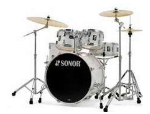
Stage Setup (additional items shown)

The AQ1 Series defines the entry into the world of the SONOR Sound - a birch shell kit, completed with a 5-piece 2000 Series hardware pack in our 2 popular configurations Stage and Studio, available in 2 classic, yet stunning high gloss lacquering finishes: Piano Black and Piano White.